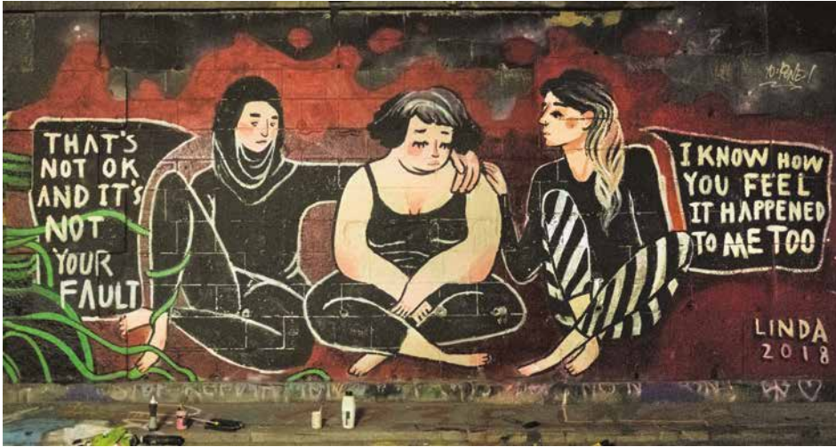
Cover image: detail from the mural Me Too (Danube Canal, Vienna) by artist Linda Steiner

"My goal was to show the support between women and their struggle with violence or unwanted situations."