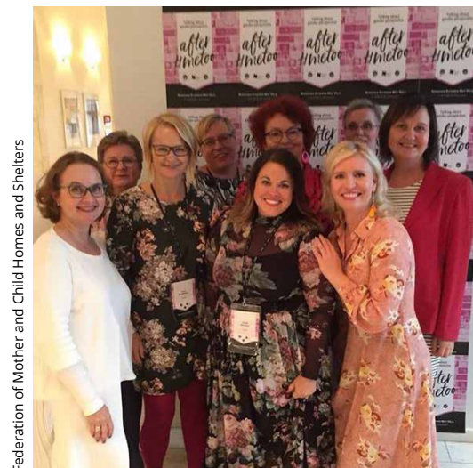
Federation of Mother and Child Homes and Shelters